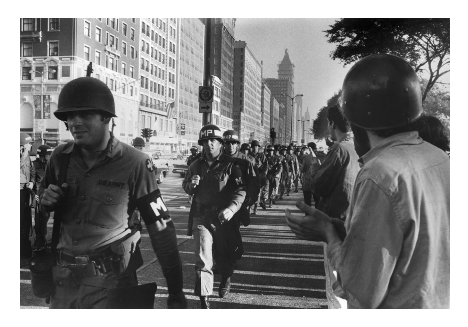
Anti-war demonstrators greet a replacement National Guard Unit, 1968.