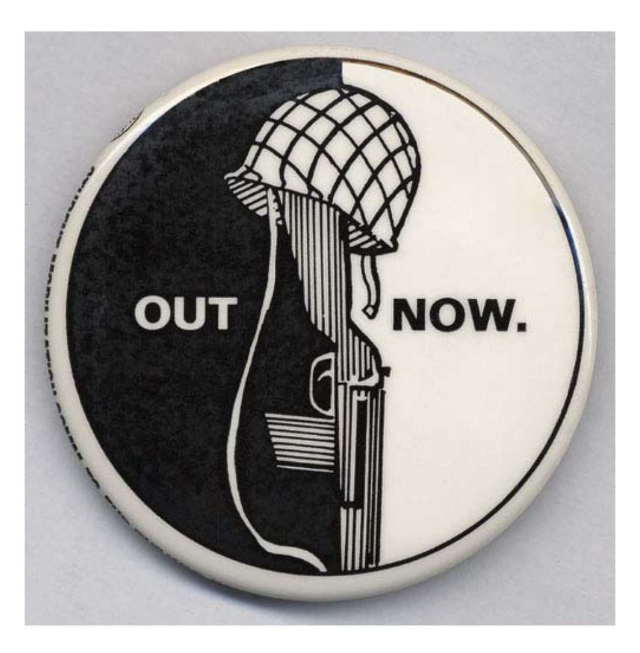
"Out Now" button, c. 1968.