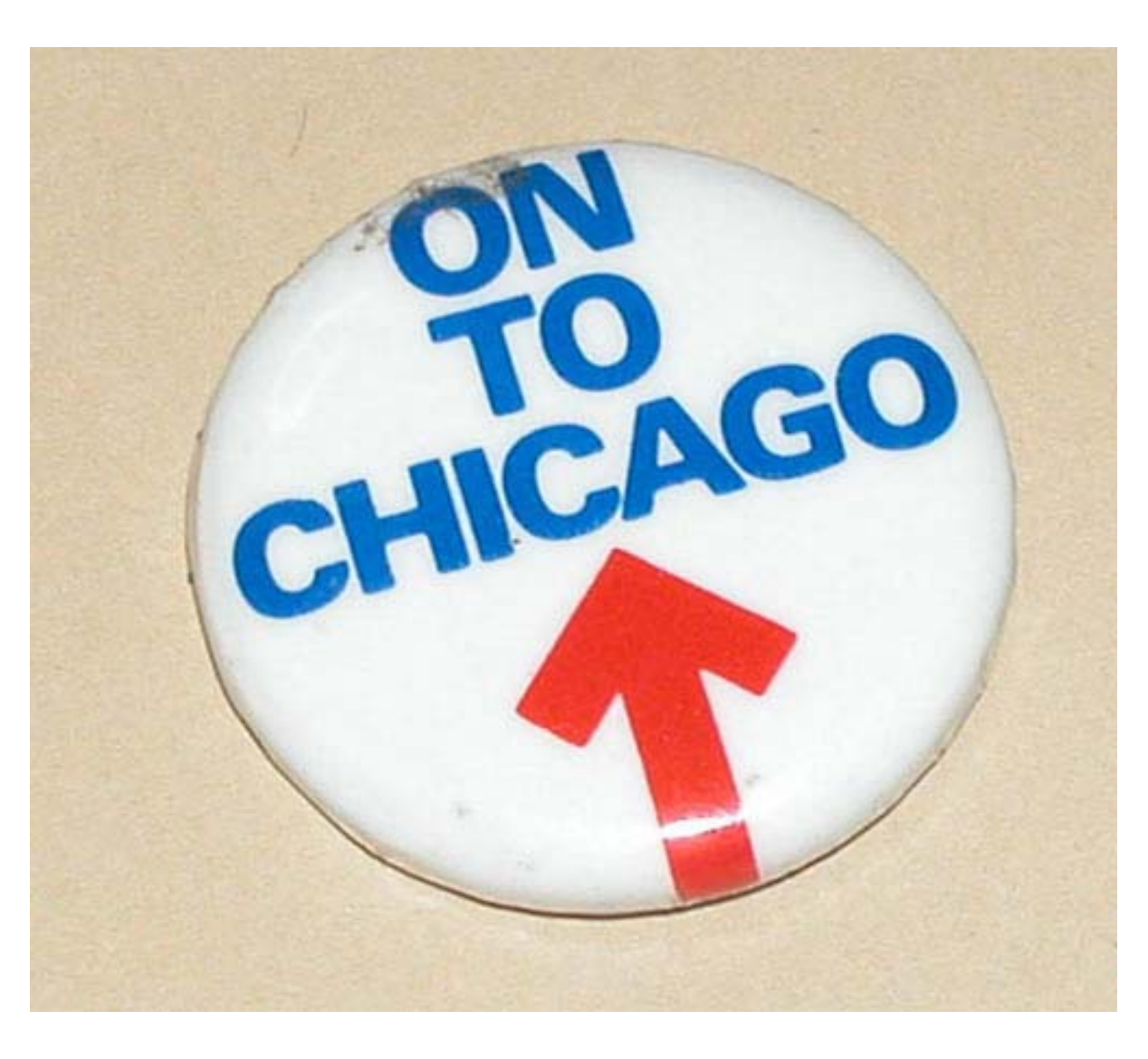
"On to Chicago" button, c. 1968.