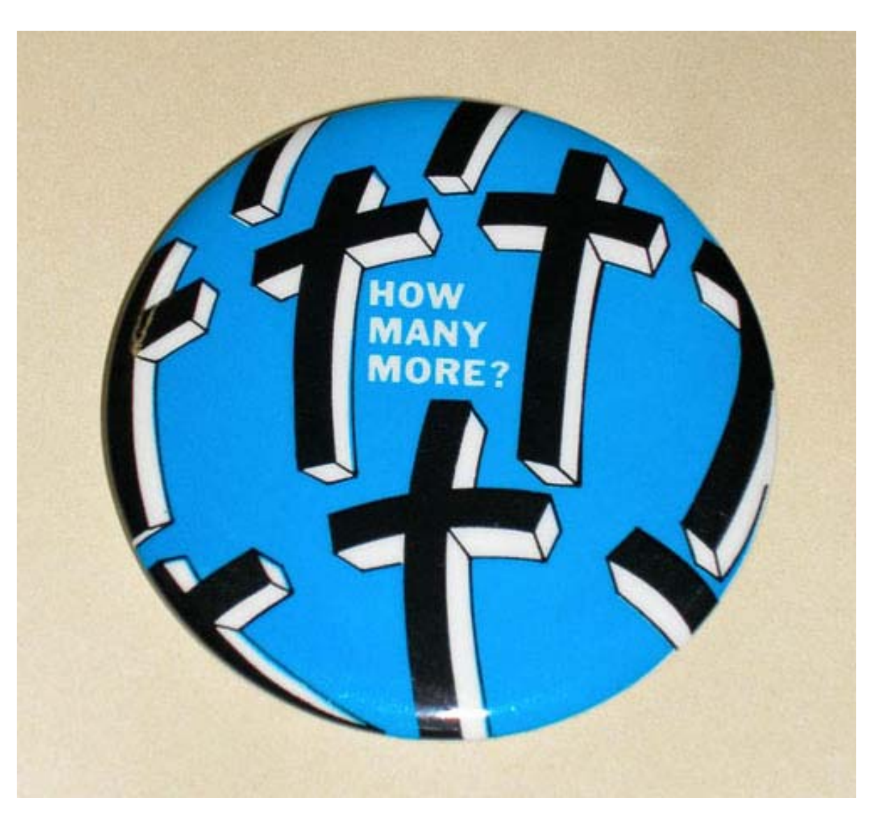
"How Many More?" button, c. 1968.