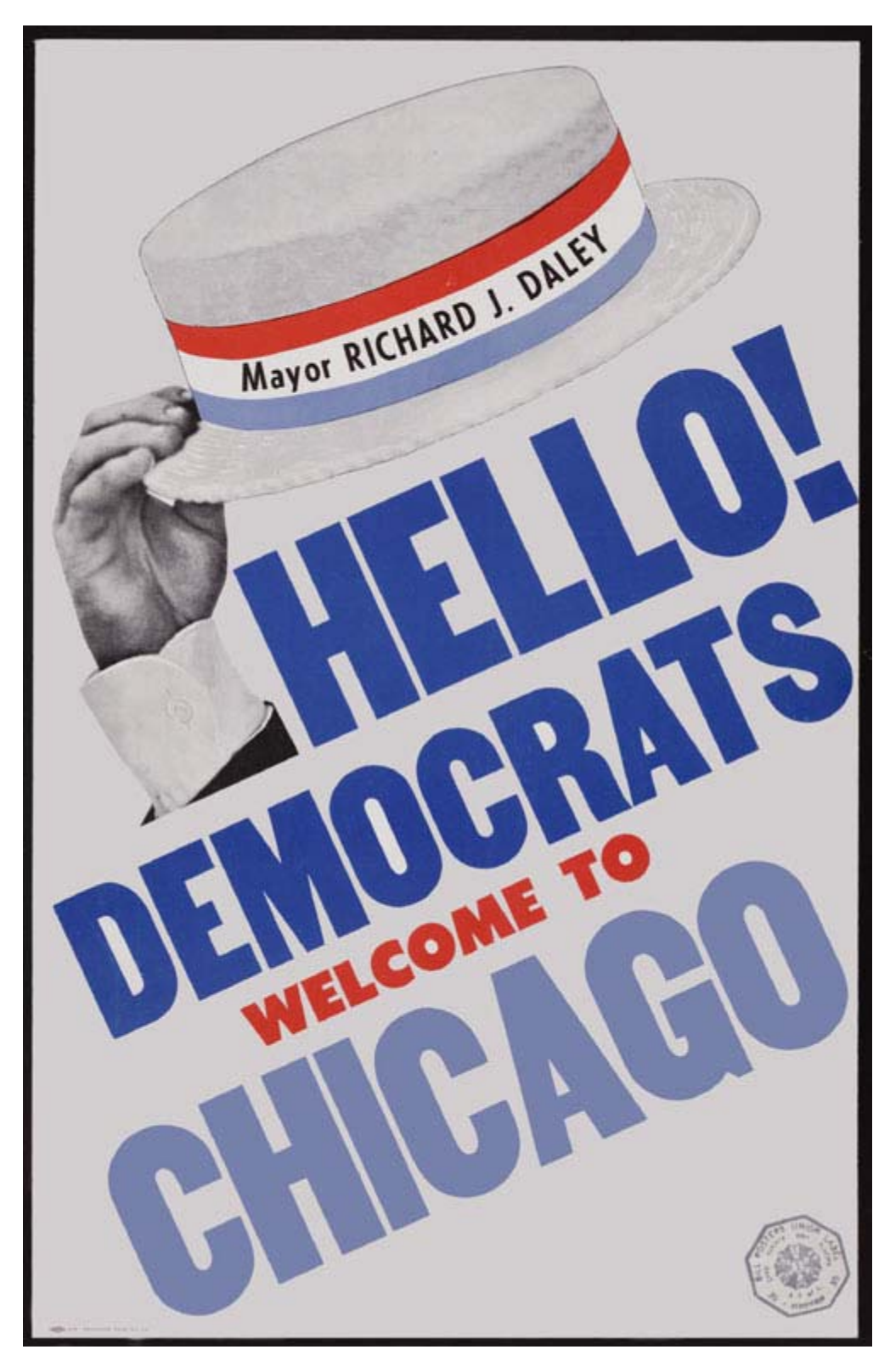
Poster welcoming convention attendees, 1968.