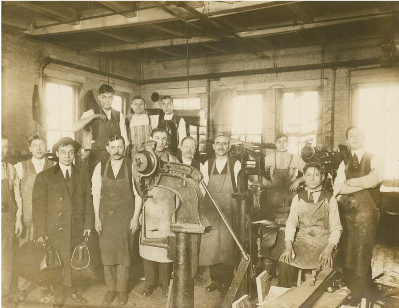
Leather workers in a factory, c. 1880s.