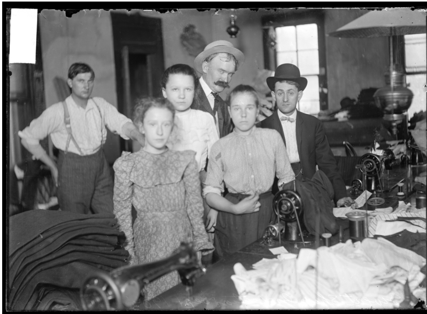
This c. 1903 photograph of workers standing by sewing machines was taken during a sweatshop inspection.