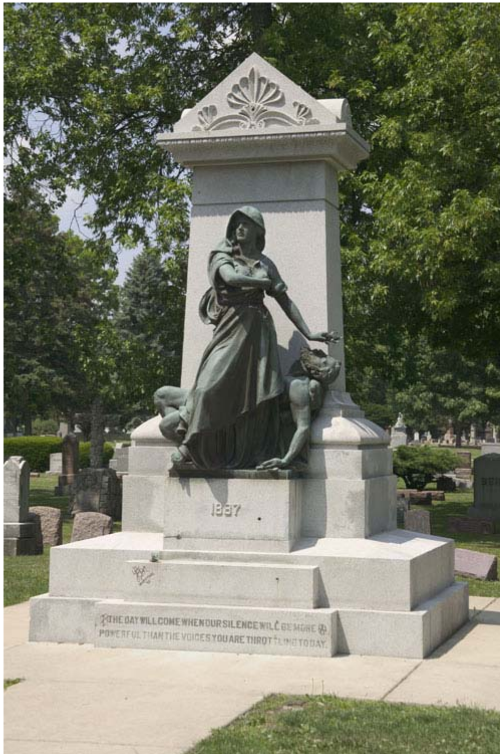
This 1893 Haymarket monument at Waldheim Cemetery depicts a defiant figure of justice inscribed with the last words of August Spies: “The day will come when our silence will be more powerful than the voices you are throttling today.”