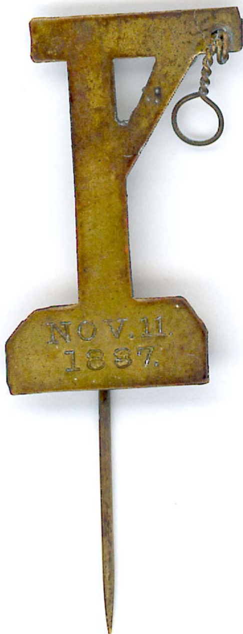
Gallows-shaped brass lapel pin stamped with the date November 11, 1887.