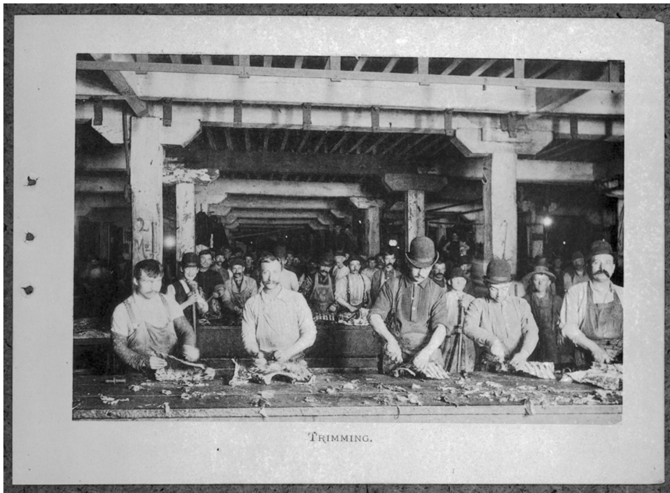
Workers trimming meat, c. 1892.