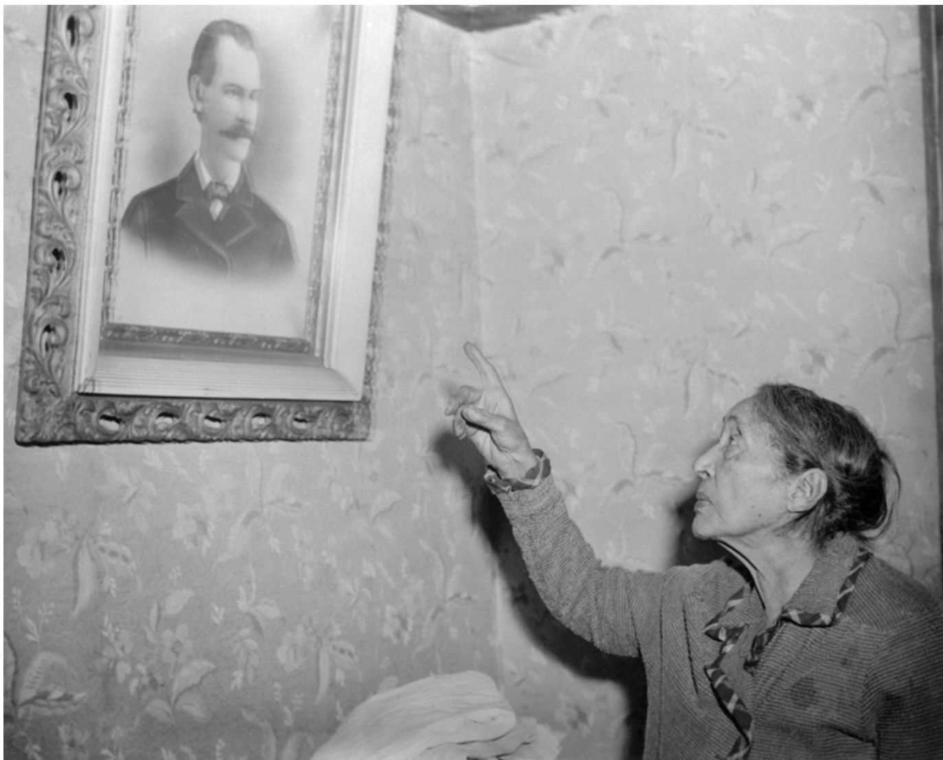
In this 1940 photograph, Lucy Parsons points to a picture of her late husband, Albert Parsons.