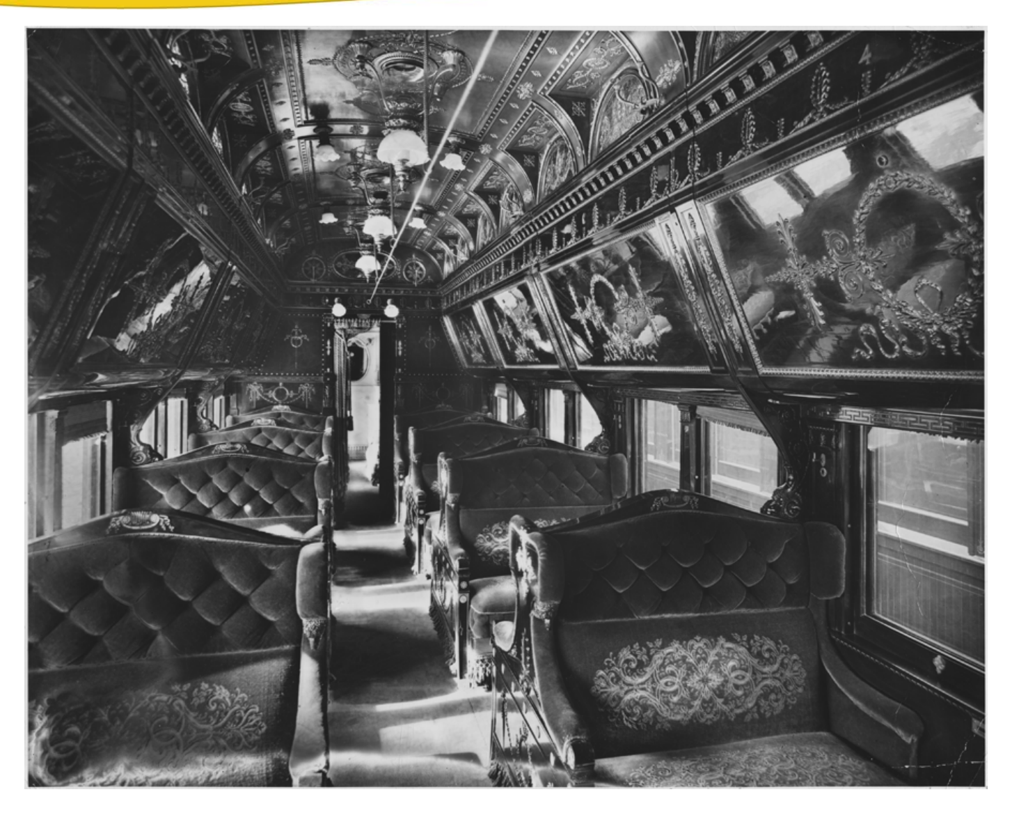
The fancy upholstery, panels, and lighting fixtures of a Pullman Palace car.