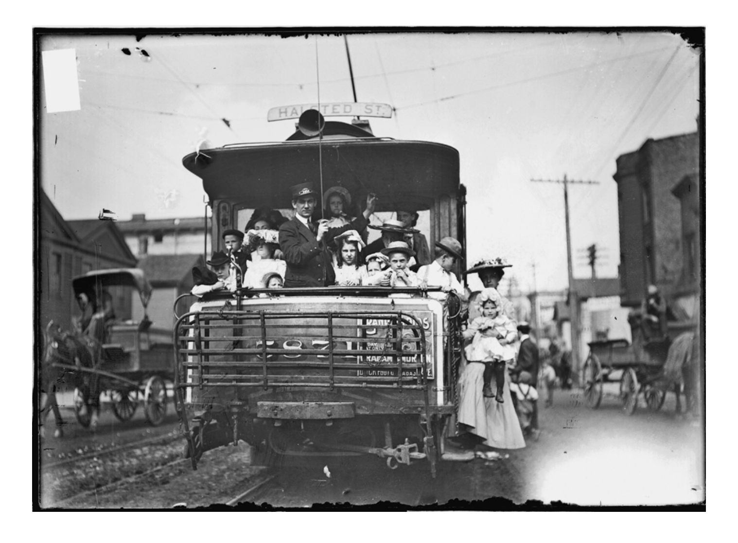
Halsted Street streetcar, c. 1905.