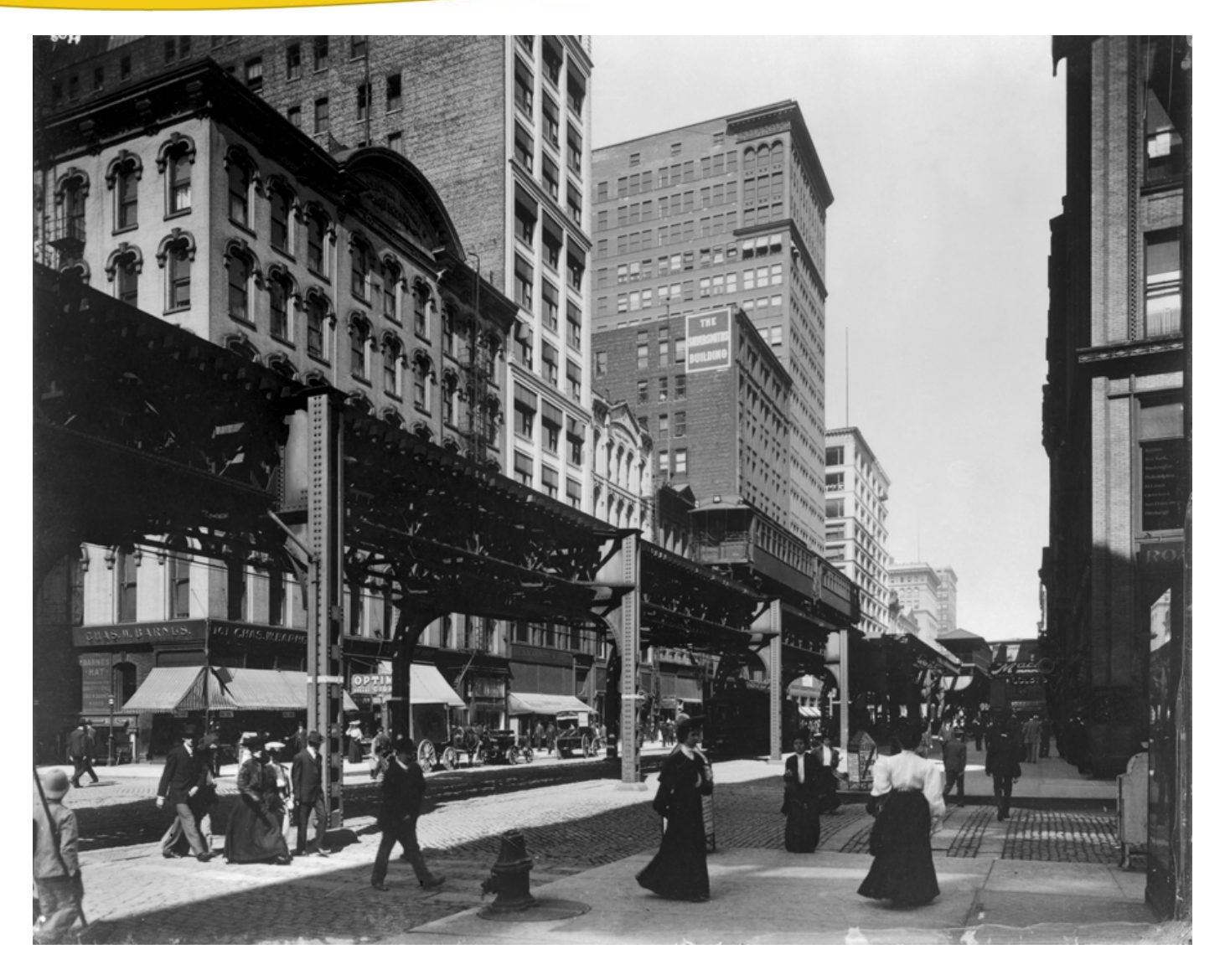
Wabash Avenue looking north from Monroe Street, c. 1900.