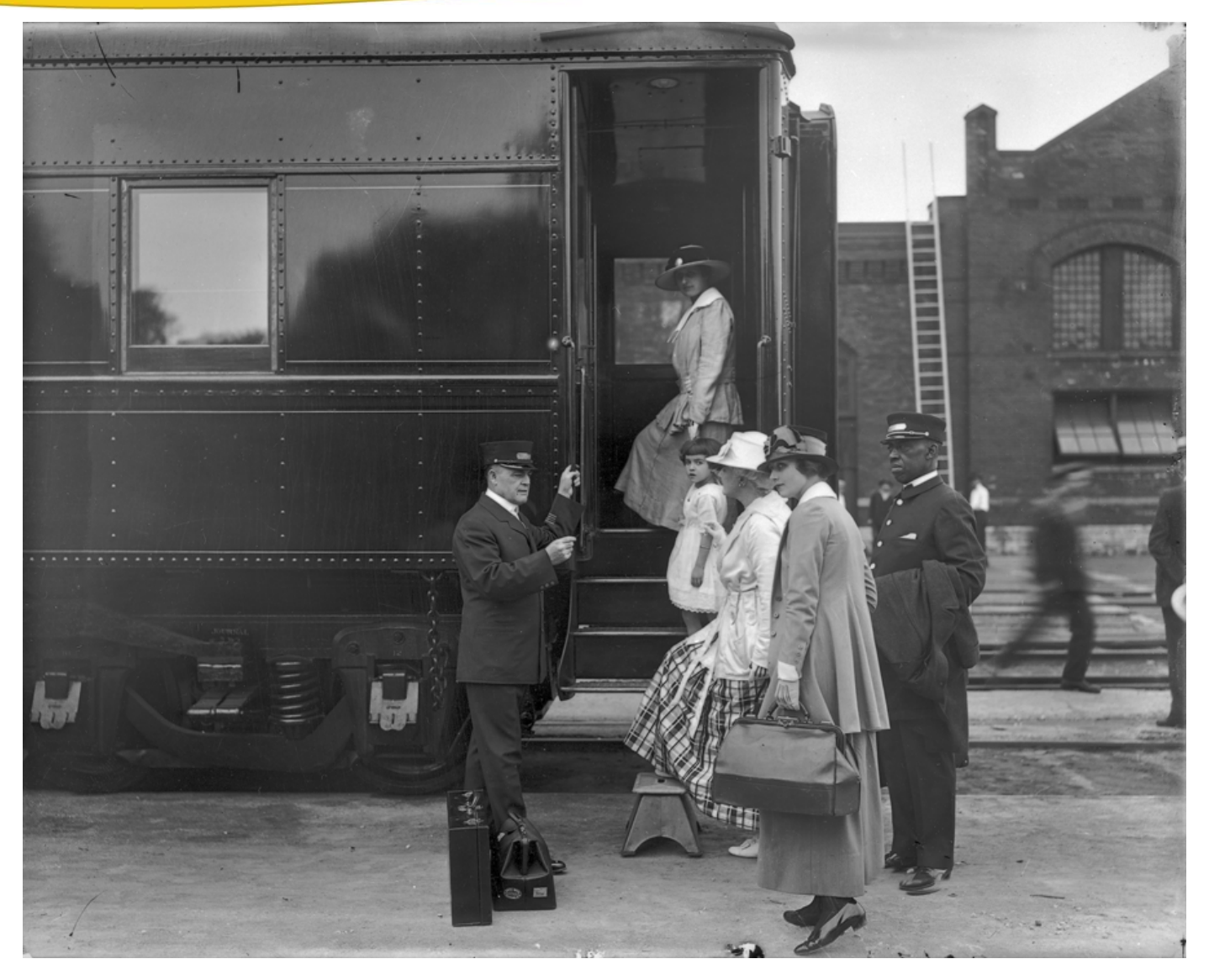
Porter assisting passengers onto train, c. 1915.