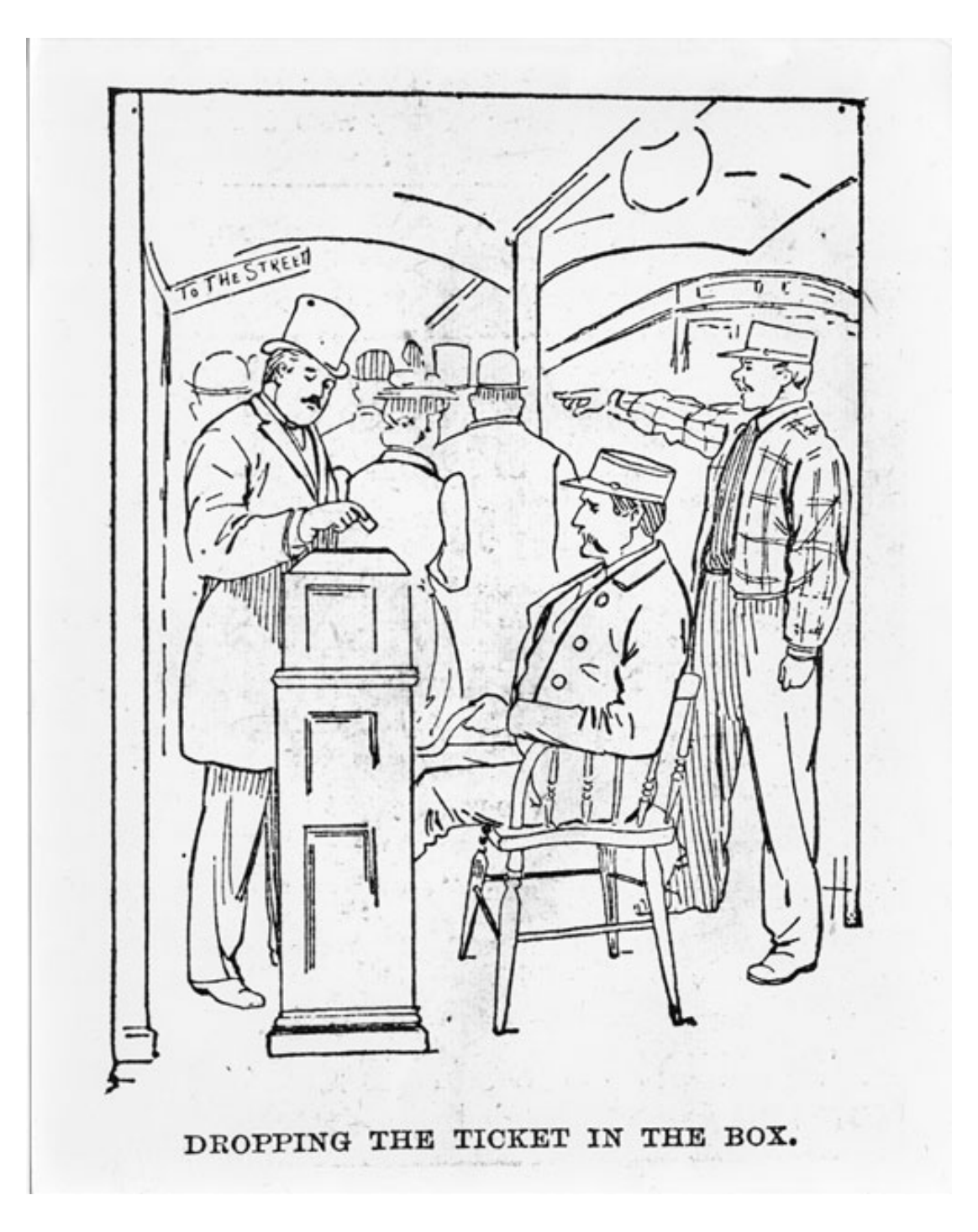
Drawing in the Chicago Daily Tribune of "L" passengers "dropping their tickets in the box," c. 1892.