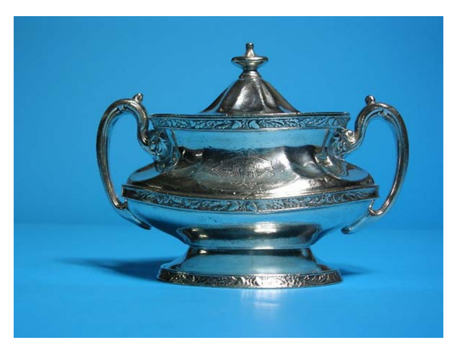
Silver sugar bowl from the Illinois Central Railroad, c. 1920.