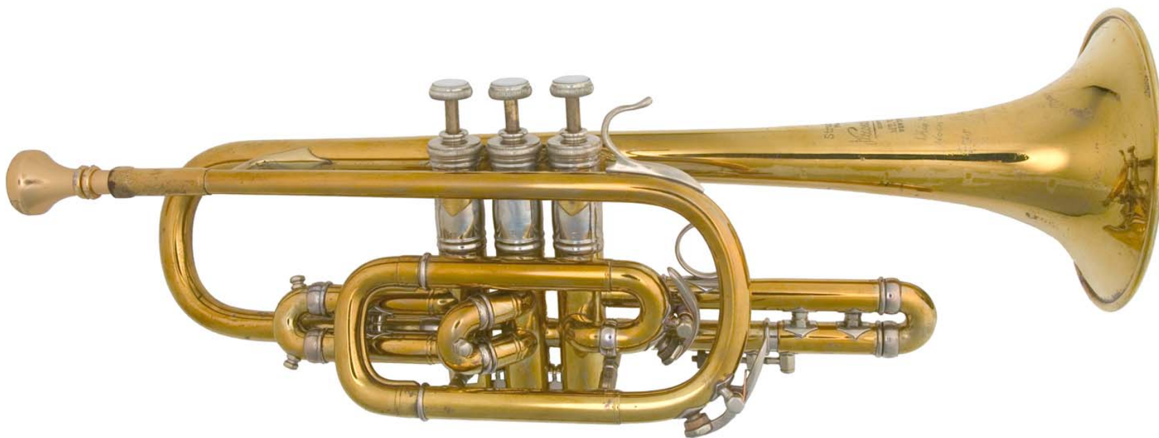
Cornet belonging to jazz musician Jimmy McPartland, a member of the Austin High Gang band, c. 1929.