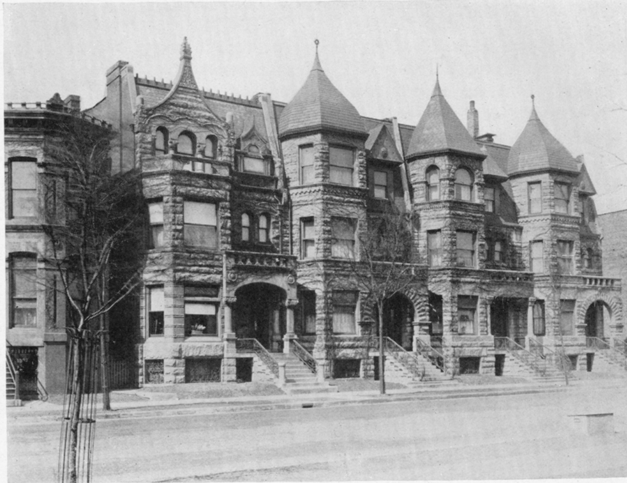
HOMES OWNED BY NEGROES ON SOUTH PARK AVENUE Classified in text as "Type A"

Homes on South Park Avenue (now Dr. Martin Luther King Jr. Drive), c. 1925.