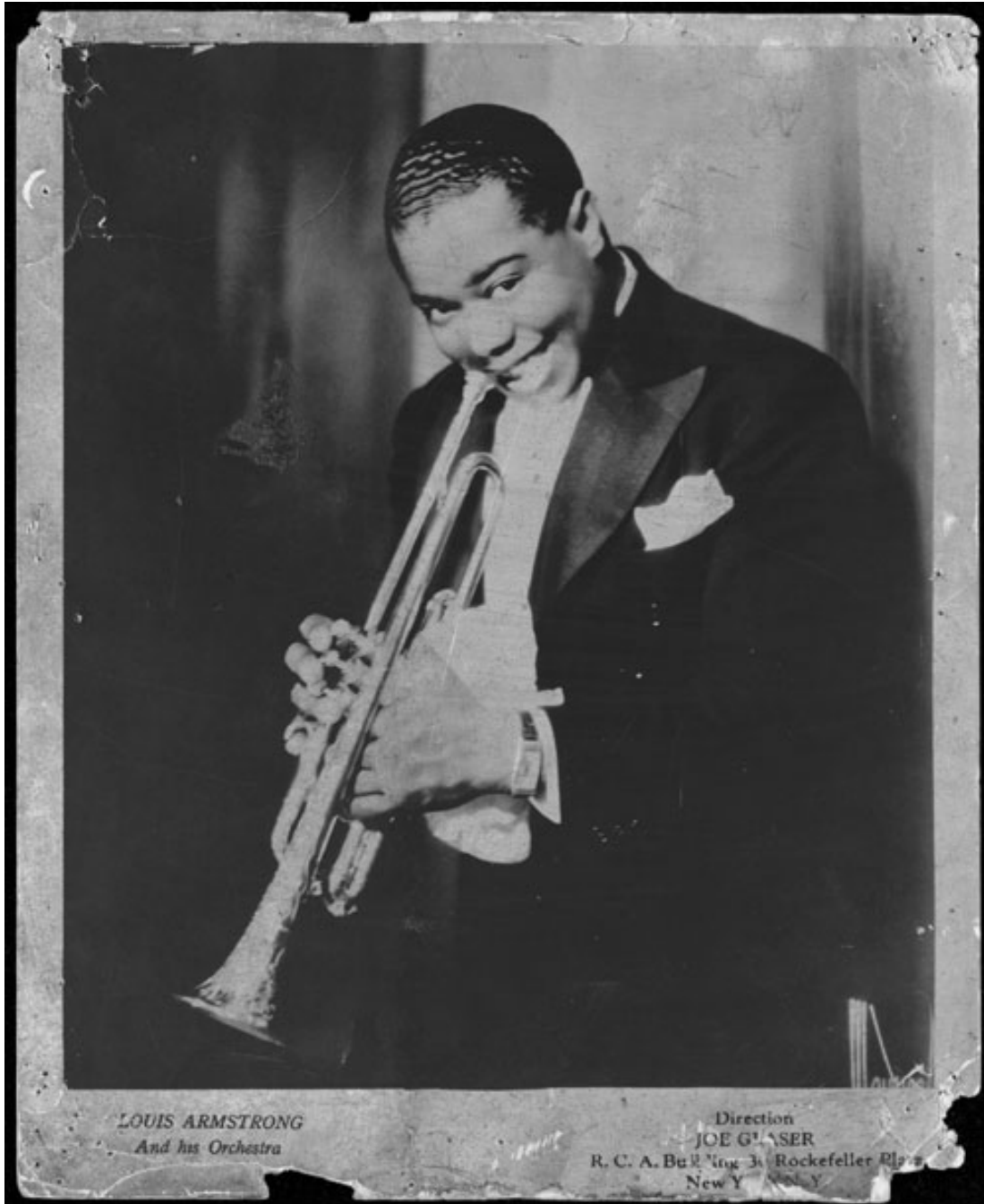
Louis Armstrong, c. 1930.