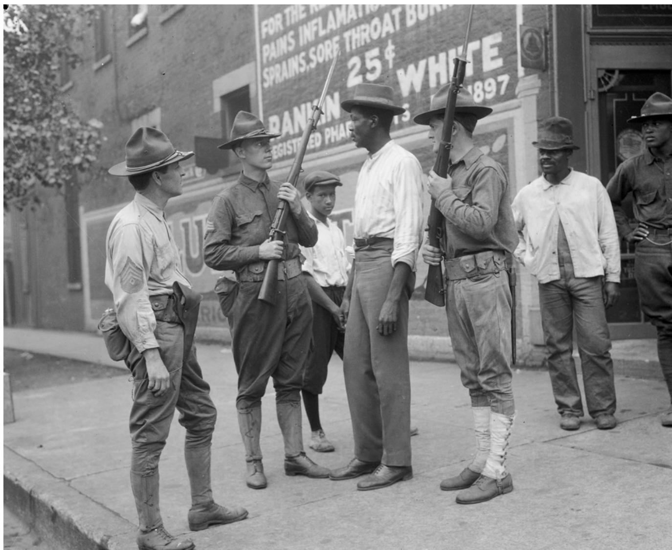
National guardsmen question an African American man during the 1919 race riot.