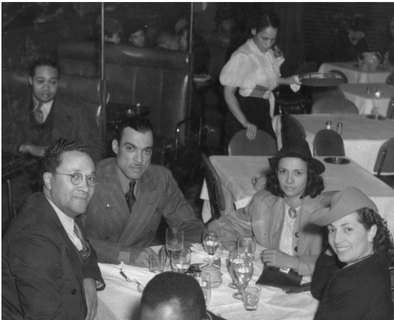
Clubgoers on the Stroll.