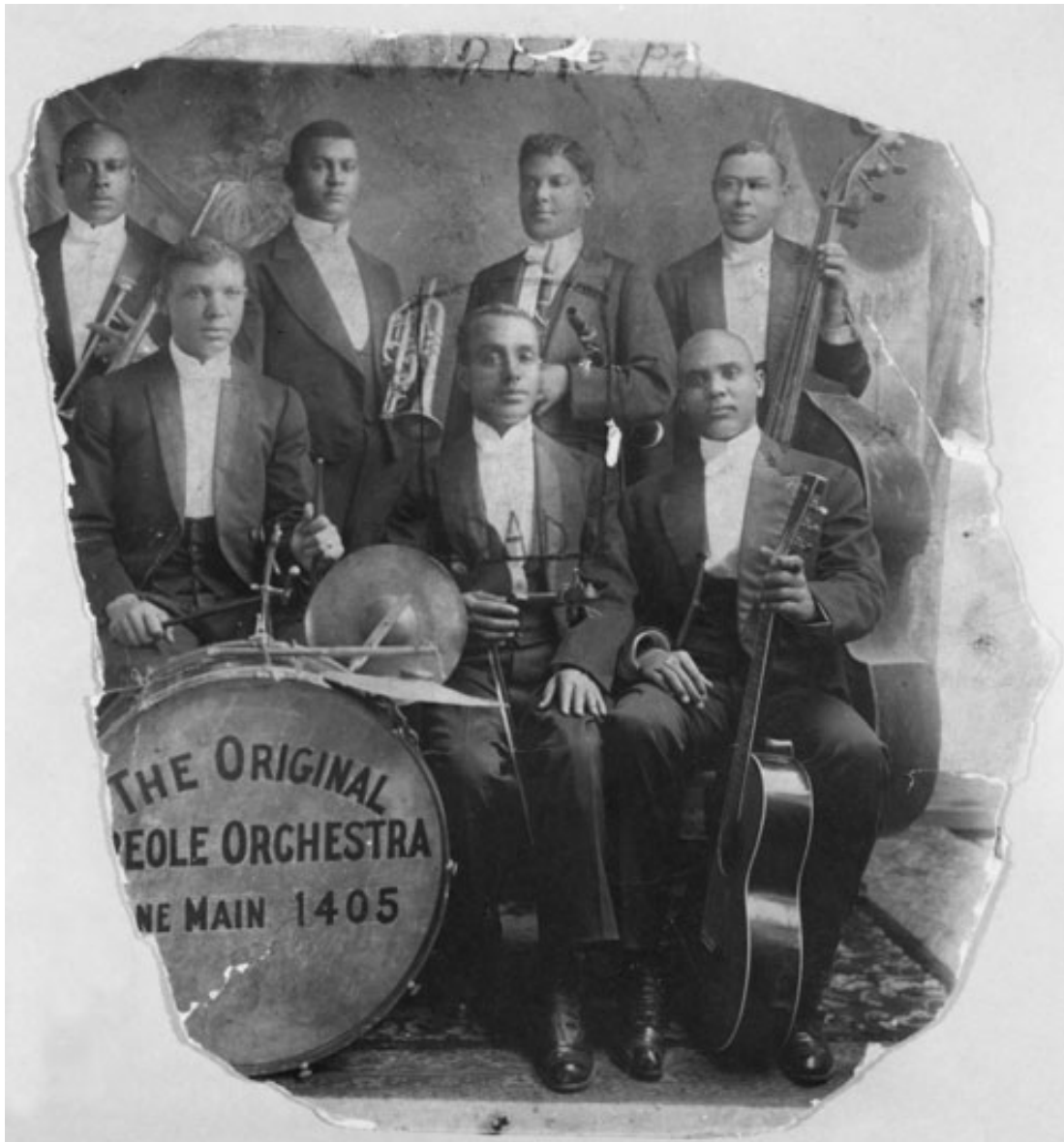
The Original Creole Orchestra was one of the first New Orleans jazz bands to tour the North.