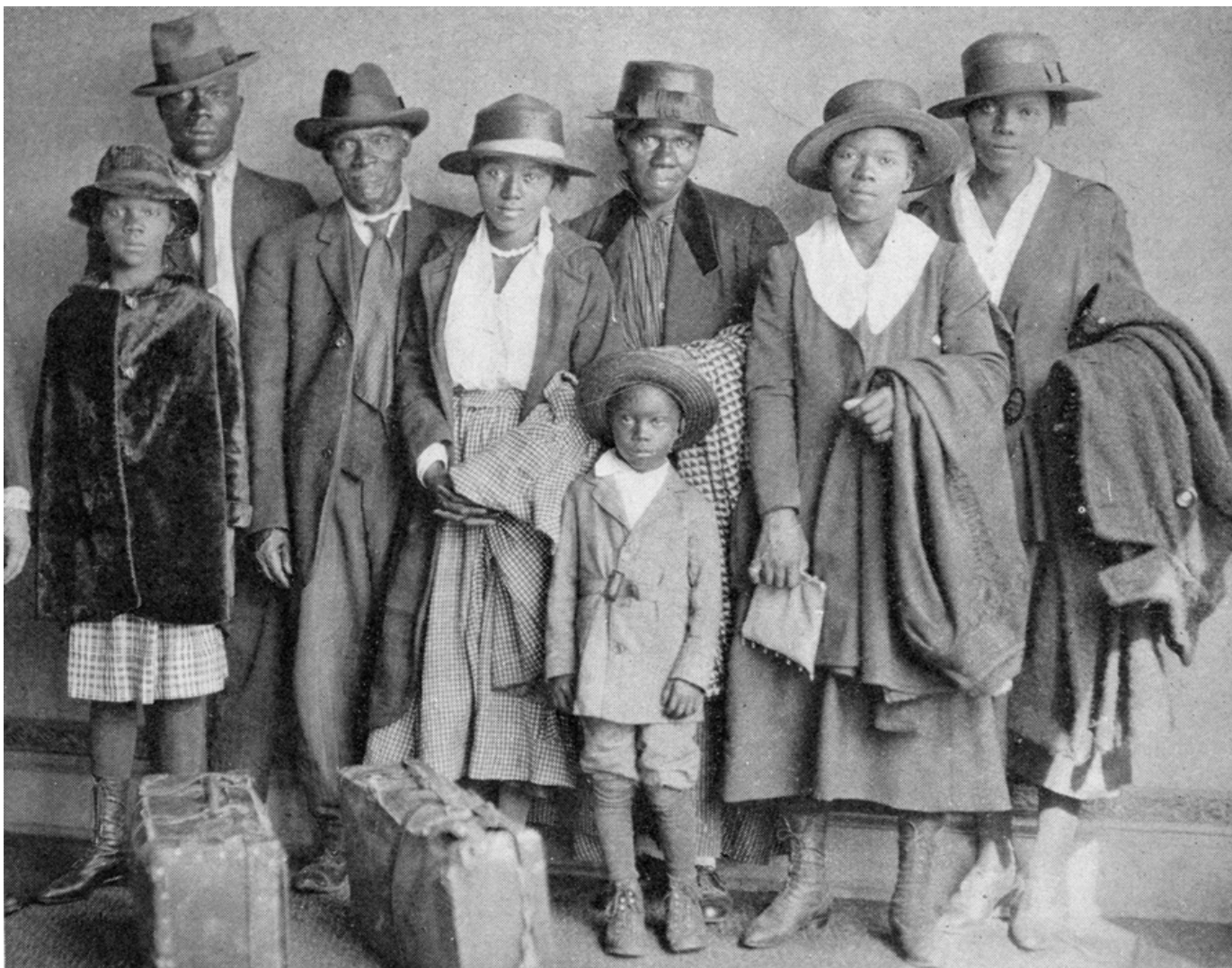
Migrant family, c. 1920.