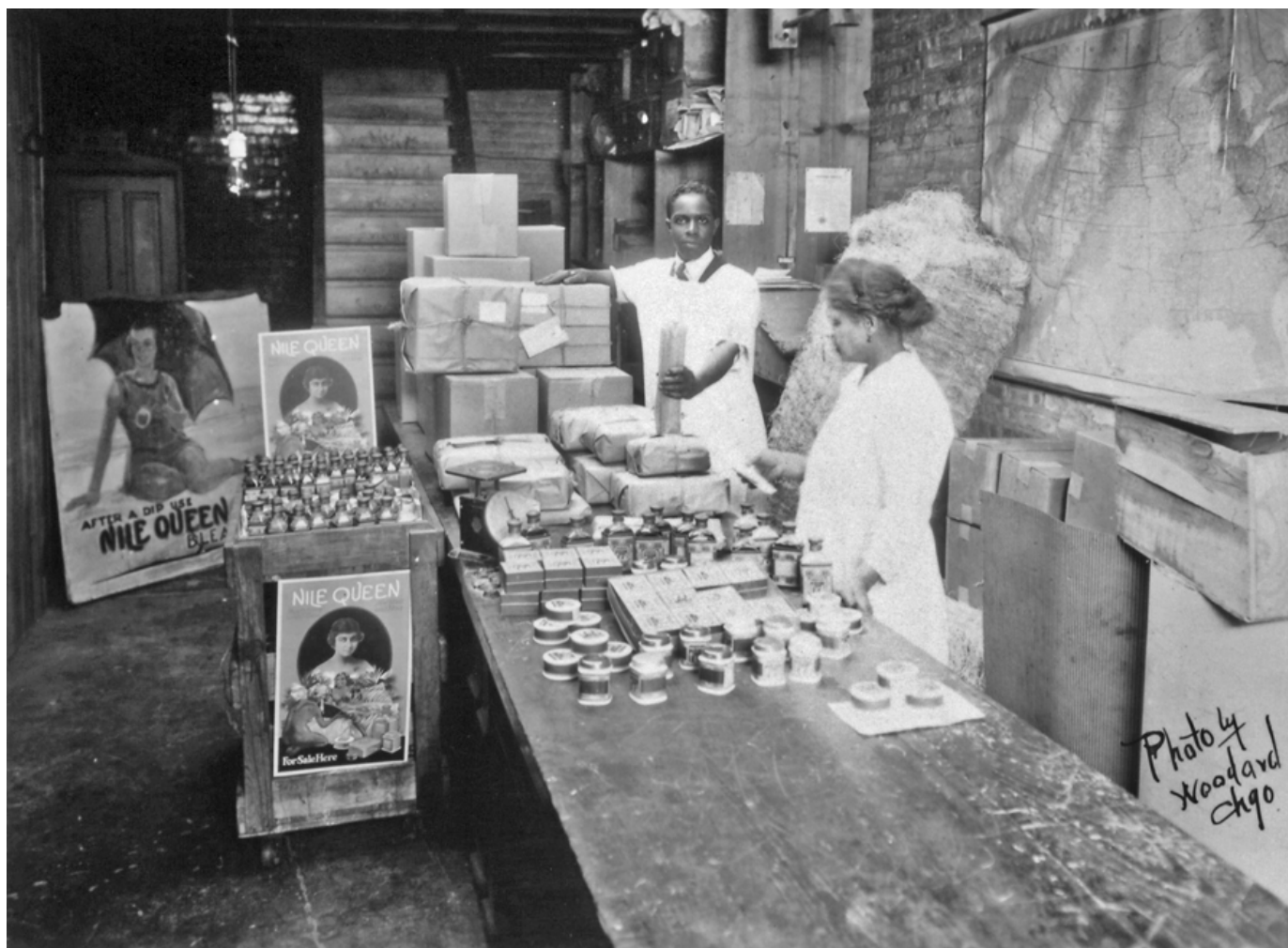
The shipping room of the Nile Queen Corporation.