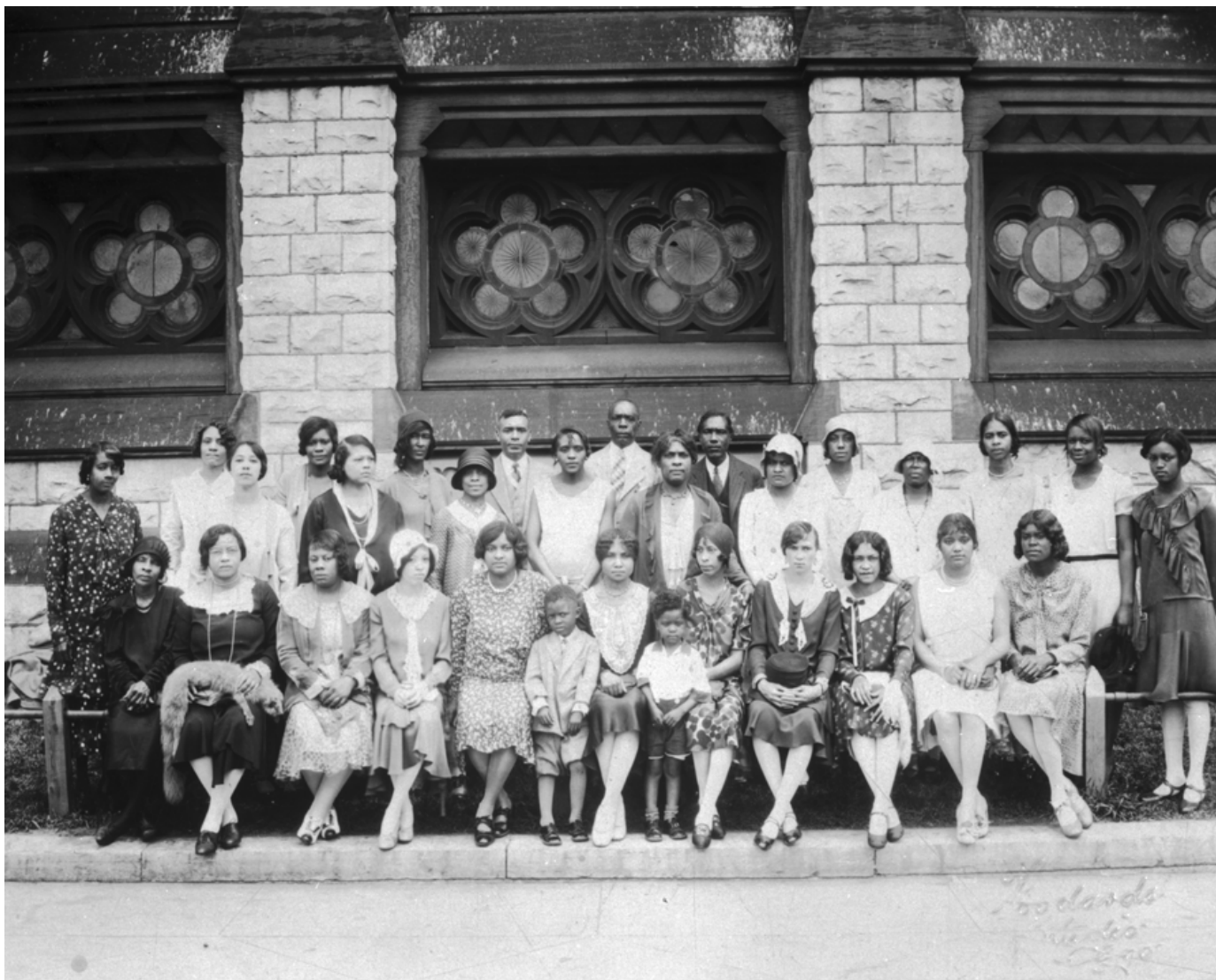
Members of the Olivet Baptist Church, c. 1925.