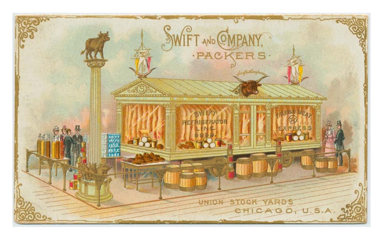
Swift and Company advertising trade card.