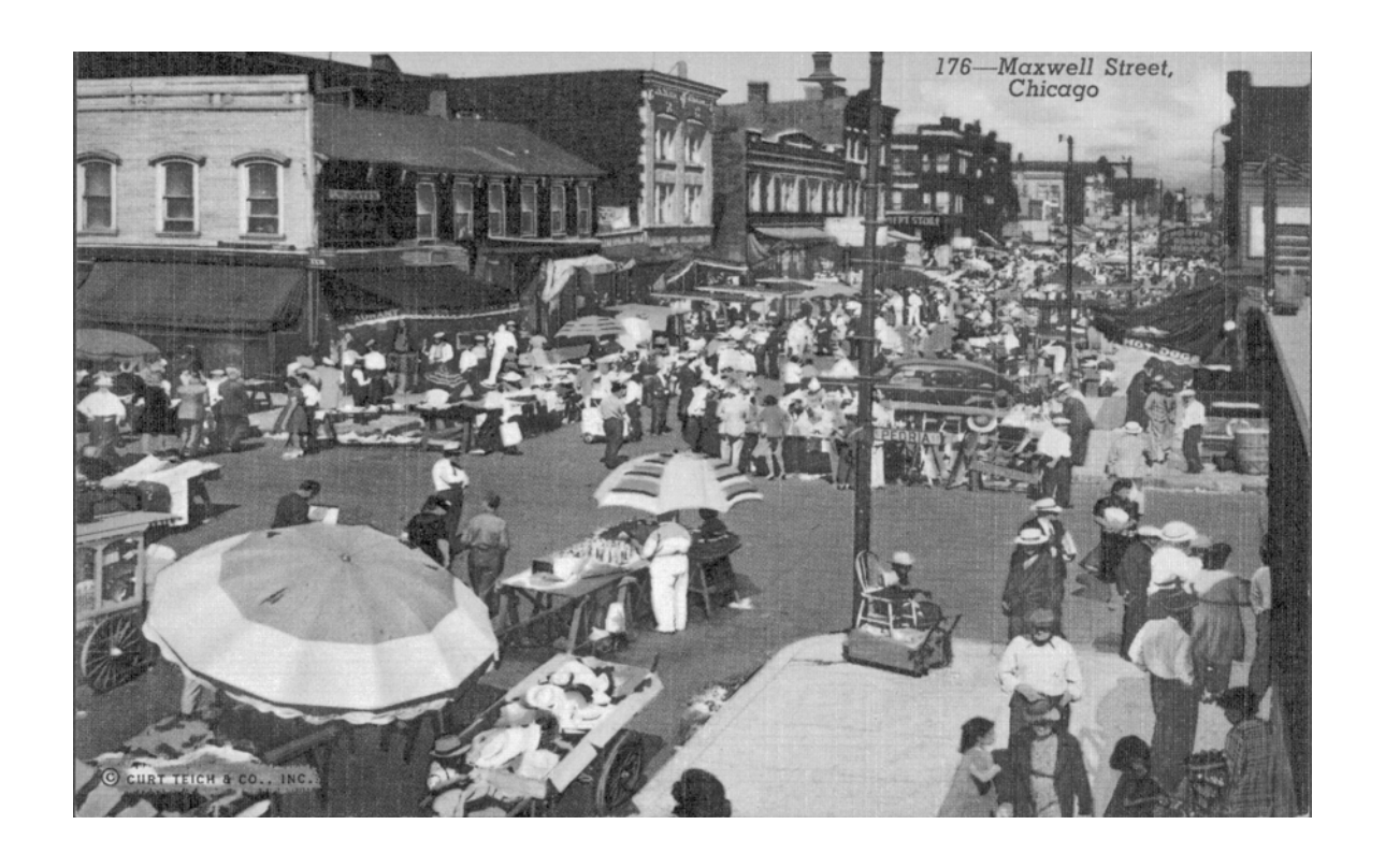
Maxwell Street and Peoria Street.