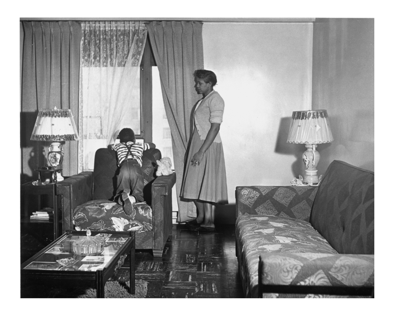
A family in their living room in Loomis Courts, c. 1954.