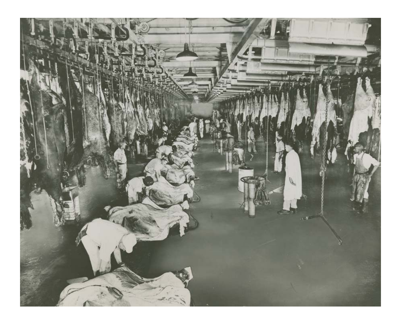
Workers at Armour and Company, c. 1952.