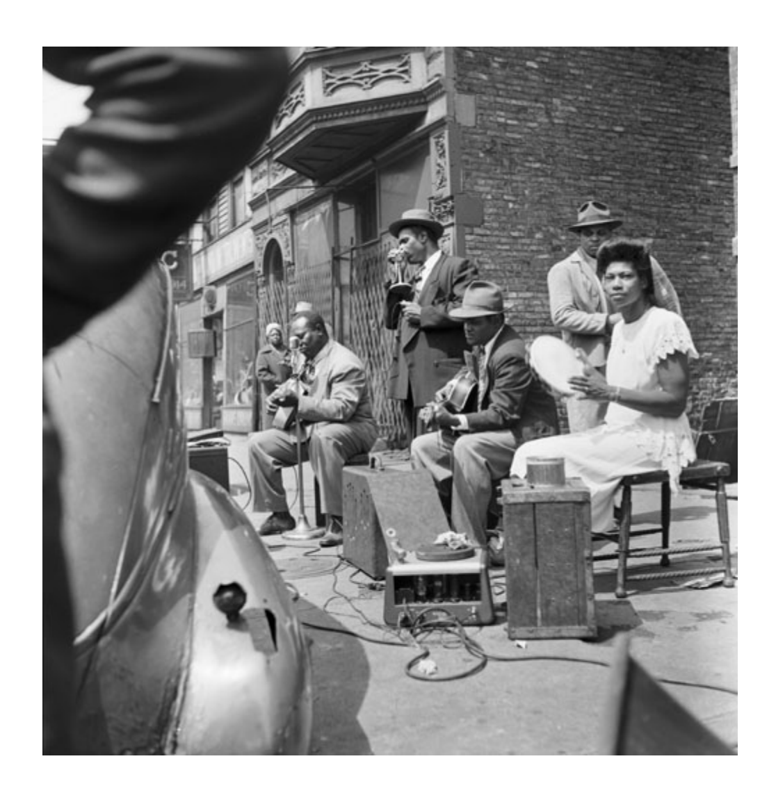
Blues musicians performing on Maxwell Street, c. 1950.