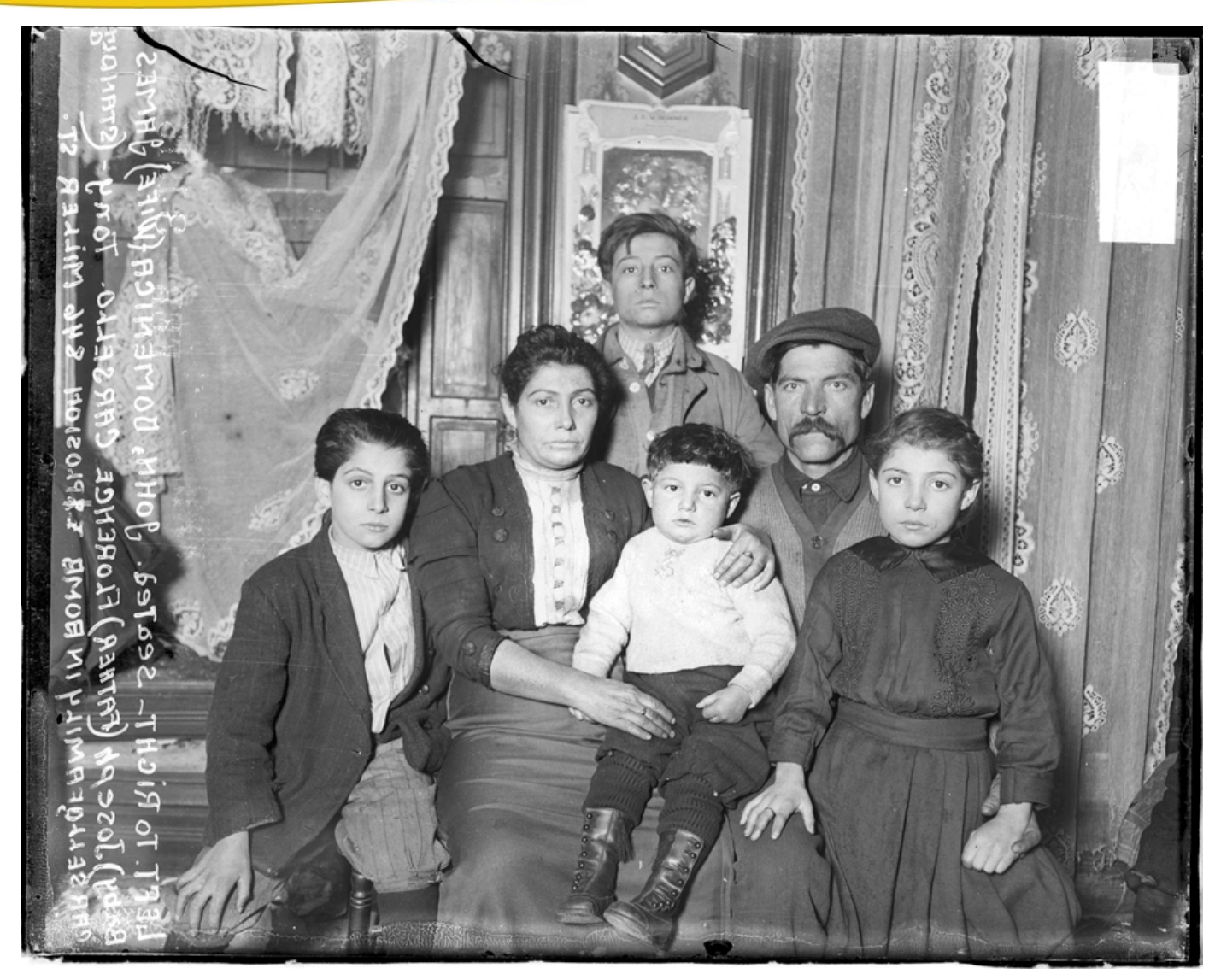
The Carsello Family of Miller Street poses for a photograph in their home in their Italian Near West Side neighborhood, c. 1915.